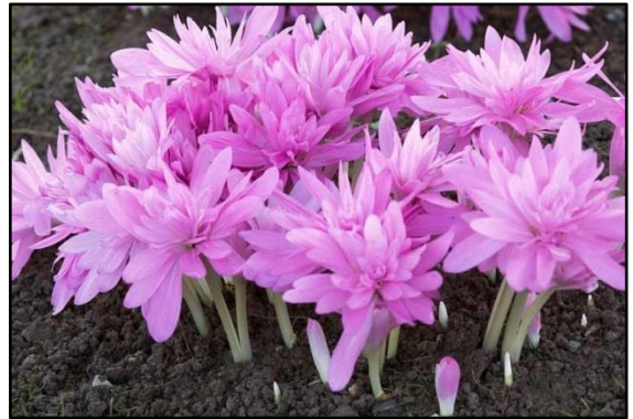
Fall flowering- Crocus sativus (Corsinii) Easily grown in average, medium moisture, well-drained soils in full sun to part shade, 10-15cm tall, $5 pack