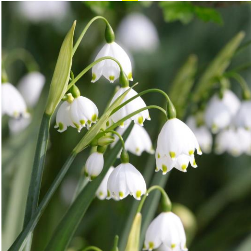
Tulip Dreamtouch 45cm tall $8 pack

Leucojum Gravetye Giant is easily grown in organically rich, medium moisture, well-drained soils in full sun to part shade. Adapts to clay soils, approx 50cm tall $8 pack