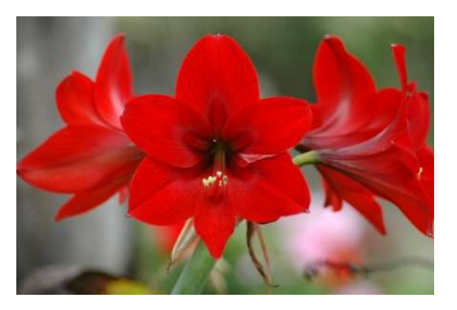
Please send in your pictures of your amaryllis, paper whites, narcissus, mascari etc. during January and February to be posted in the March edition of Streetsville Blooms.