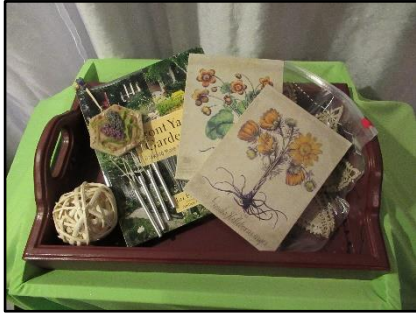
April Draw Prizes