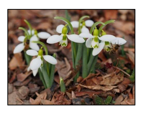
Grace Nelham found the first of the bees filling up on pollen.