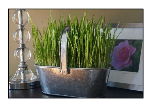
Luiza Gubernat experiments with growing wheat grass to use as a centrepiece for dinner parties.