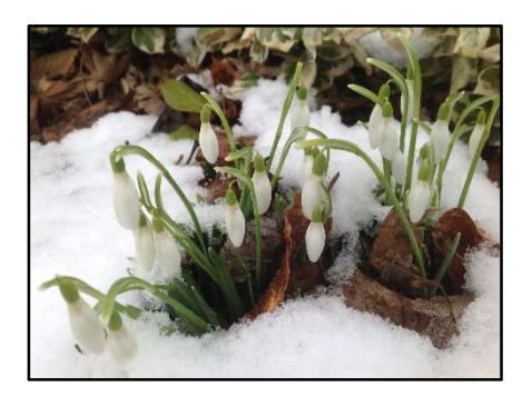
Shirley Boyes sends us snowdrops peeking out from beneath the snow.