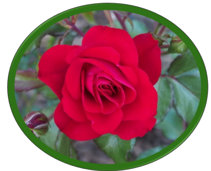
Rose picture