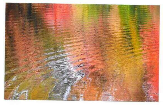
Very nice capture of colour and movement here. It is very difficult to photograph an image with colour and movement in the same shot. The only way to do this successfully is use water as a background. The ripples in this shot lead the eye into the photo from the bottom right to top left corner. Depth of field is perfect and full.

If you are interested in next year's contest, please check out: https://www.streetsvillehort.ca/flowers-photos/Streetsville Horticultural Society Photo Contest 2023 – 2024 Christina Anonychuk, Photo Contest Coordinator