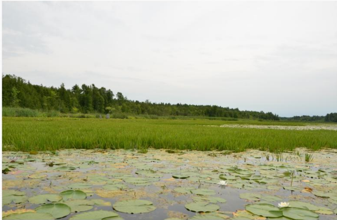
Water soldier forms dense mats of vegetation at the surface, as seen in this 2014 photo taken by M. Smith.

Over the course of the summer, the ISAP and MNR staff had staff on the water almost every day, searching out and mapping locations where water soldier plants were observed in the Trent Severn Waterway, thanks to a grant of $35,000 from the Invasive Species Centre. The use of an underwater camera on loan from Trent University was very helpful in accurately documenting these plants in waters that were too deep to see plants from the surface.