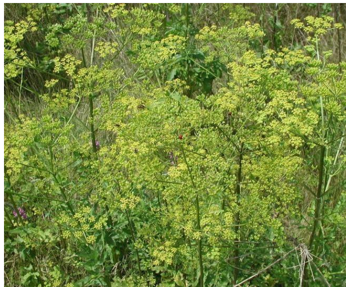
Wild Parsnip in bloom.

Wild Parsnip ( Pastinaca sativa ) is a perennial plant native to Europe and Asia. It arrived in North America along with European settlers who grew it as a root crop. Wild populations are thought to be a result of escaped cultivated plants. Seeds can be spread by wind, water, and on vehicles and equipment. Wild Parsnip grows quickly and forms dense stands which can outcompete native species and infest agricultural areas. As